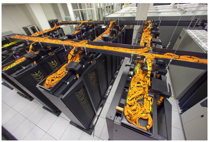
The Carver IBM iDataPlex supercomputer at NERSC at Lawrence Berkeley National Laboratory does much of the real-time analysis of images for the PTF, comparing digital images taken with the 48 -inch Samuel Oschin telescope on Mount Palomar with reference images to identify supernovae. It found SN 2011fe.

In a paper published in Nature on December 15th, 2011, Nugent and coauthors conclude that SN 2011fe was a white dwarf star 1.4 times as massive as the sun, but only the diameter of Earth. It was stealing gas from a close sun-like companion until a runaway thermonuclear explosion ignited. Found only 11 hours (plus 21 million years!) after it exploded, it was the youngest supernova ever detected. -Trudy E. Bell, M.A.